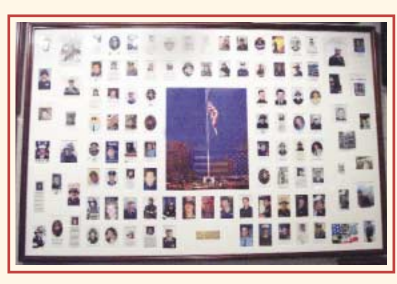
Photographs and remembrances as placed on California Memorial Monument the day of the memorial dedication, December 8, 2001. (Wall #7)