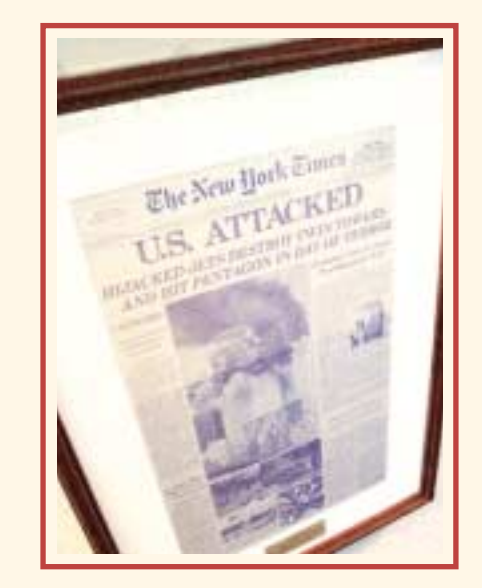
Original New York Times printing plate from September 12, 2001. (Wall #8)