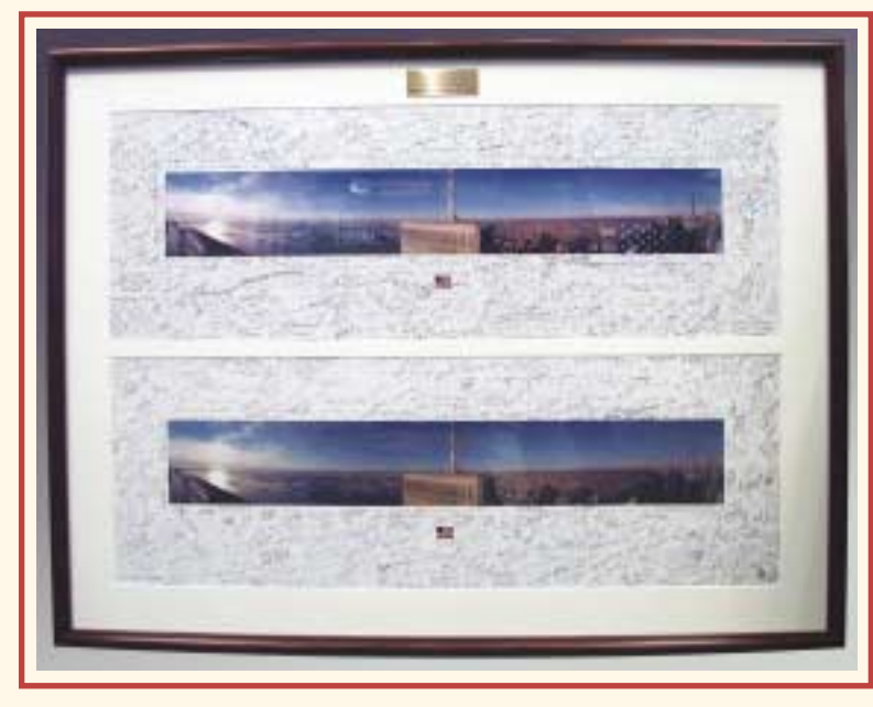
World Trade Center photographs signed by Fire and Police personnel who participated in World Trade Center rescue and recovery operations. (Wall #7)