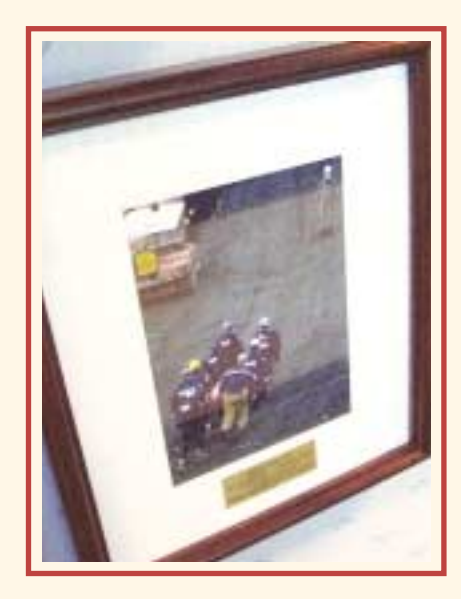
Photograph of the recovery of Port Authority K-9 Sirius, Badge #17. (Wall #8)