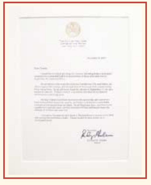
Words of appreciation to Pelco from the New York Mayor, Rudolph Guiliani. (Wall #7)