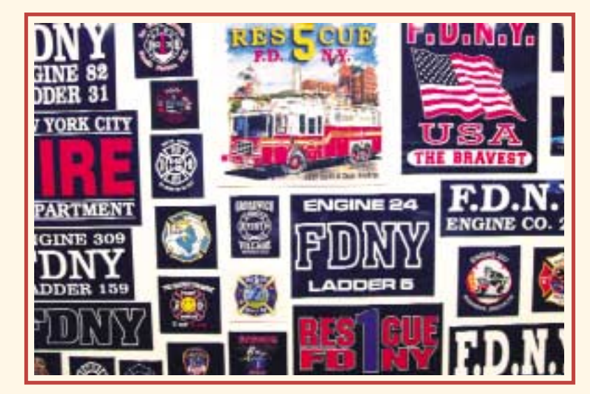
Collection of FDNY commemorative T-shirt art. (Wall #7)