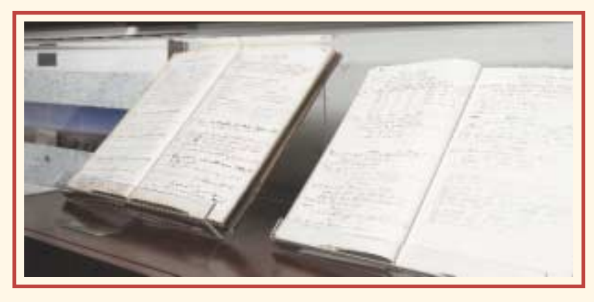
Official Log Book from FDNY #758, Hose Wagon #157 from April - October, 1920; and the Official Log Book from Fresno Fire Department Engine #3, Truck #2 from October - December 1953. (Wall #7)