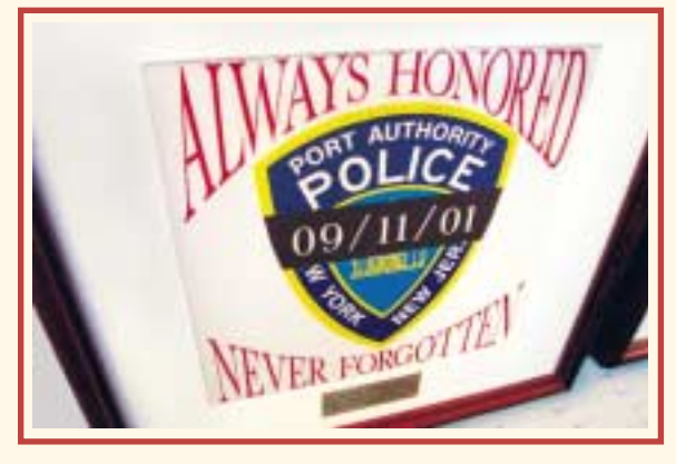
Actual sign from Port Authority Command Post at World Trade Center Ground Zero. (Wall #8)