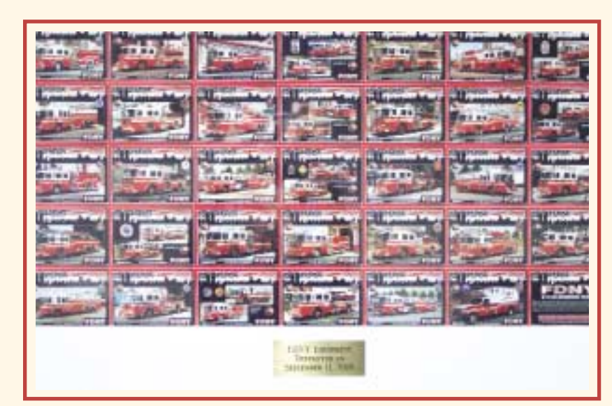
A collection of photographs representing all of the FDNY equipment destroyed on September 11, 2001. (Wall #3)