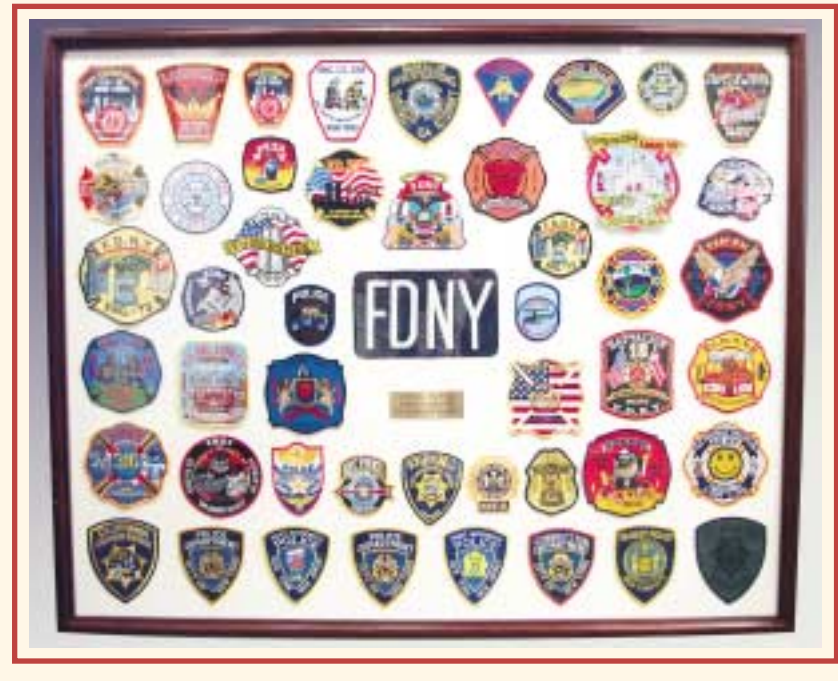
NYPD, FDNY, Port Authority, and Fresno/Clovis Officer Patches. (Wall #7)