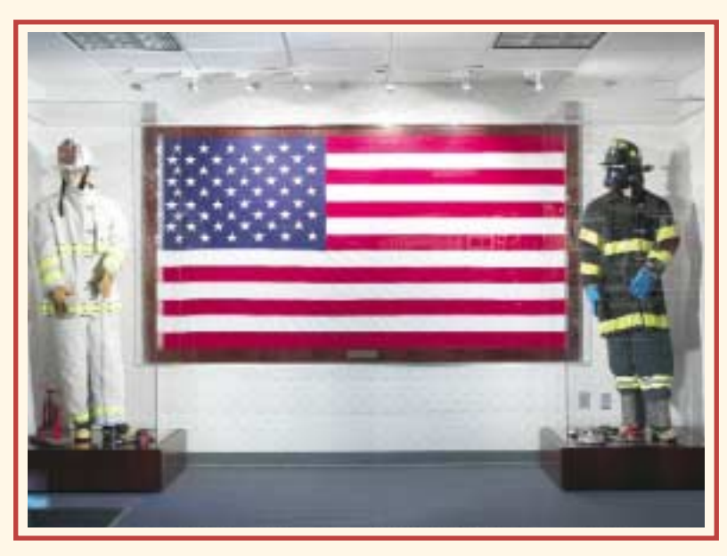
Actual Firefighter uniform worn during Ground Zero rescue operations (right). Firefighter uniform presented to David L. McDonald from City of Clovis Fire Department (left).

Center – Actual American flag flown by FDNY Truck #10 on September 11, 2001 – during rescue and recovery operations. (Wall # 1)