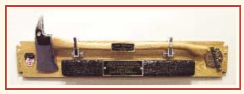
A very special gift ax from FDNY Officers and Firefighters of Engine Company #164 and Ladder Company #84. (Wall #6)